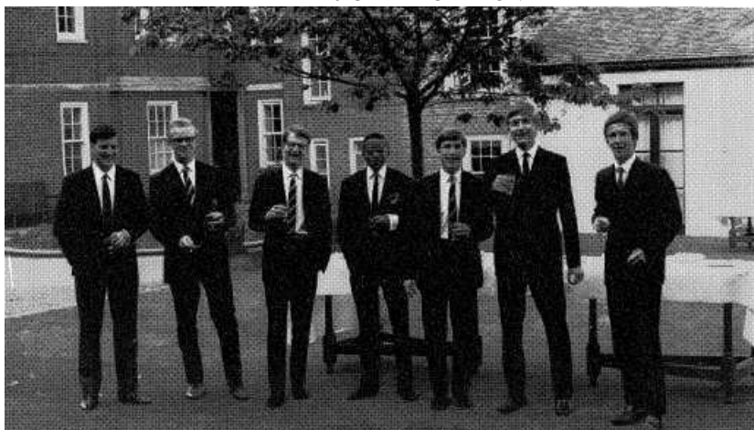
The J.C.R. Committee